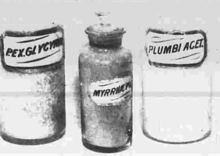
APOTHECARY BOTTLES BELONG TO MANCHESTER CLERGYMAN

former psychotherapist now works with carousel's fulltime... Baking soda kills germs in mouth... The September issue of Science Digest magazine reports that scientists at the University of California, San Francisco, have recently con-